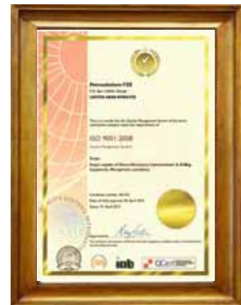
ISO 9001:2008 certified